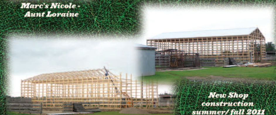
New Shop construction summer/fall 2011