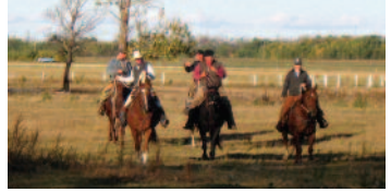
"THE CREW COMING HOME"