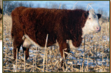
Mother of Lot 36 & Grandmother of Lot 35 Pictured at 16 Years of Age JNHR STANDARD DEE 330H