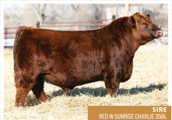
SIRE RED W SUNRISE CHARLIE 358L

Here is a big-time herd bull that we are extremely excited to bring to you. He is dark haired, Nice fronted and extremely attractive. These are the first sons to sell off the $100,000 Red W Sunrise Charlie 358L that went to the good family and good cattlemen at Allison Farms. 358L was arguable one of the most exciting red bulls we have ever raised. He was an exciting herd bull that did so many things correct. He was perfect in his structure and phenotype and stood on an exceptional big dark foot. Not to mention one of the best attributes about 358L was his beautiful Brown Creek Dam. She checks off all the boxes, she is beautiful uttered, highly productive and has perfect feet. 171N only adds to this highly maternal pedigree. His dam Red W Sunrise Sunflower 325G is a beautiful made cow with an exceptional utter. The maternal predictability in this young herd bull is unmatched