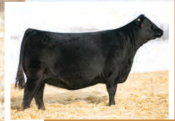
MATERNAL SISTER TMP 24J