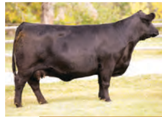
DAM BROOKING ANNIE K 6133