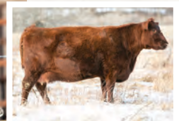
DAM RED HOWE JOANNA 145C