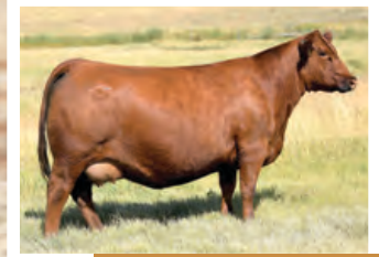
DAM RED MOOSE CREEK BRNDINA 26E