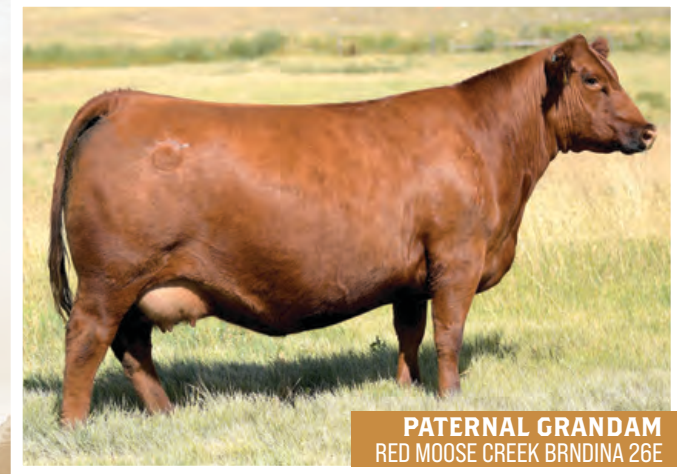
PATERNAL GRANDAM RED MOOSE CREEK BRNDINA 26E