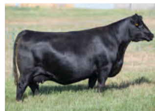
MATERNAL GRANDAM SOO LINE ANNIE K 2176