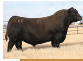
SIRE RF LIT UP 357