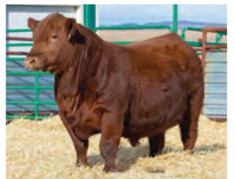
PATERNAL GRANDSIRE RED SSS GOOD TIME CHARLIE