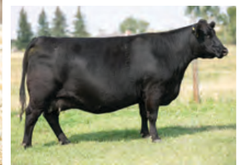
MATERNAL GRANDAM W SUNRISE BLOSSOM 723E