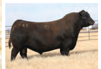
SIRE RF LIT UP 357