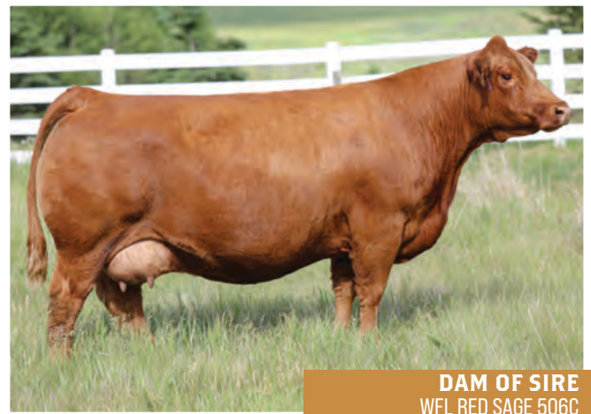
DAM OF SIRE WFL RED SAGE 506C