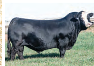
SIRE CROSSROAD DATELINE 59L