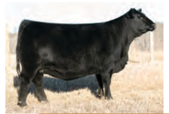
MATERNAL SISTER 570H