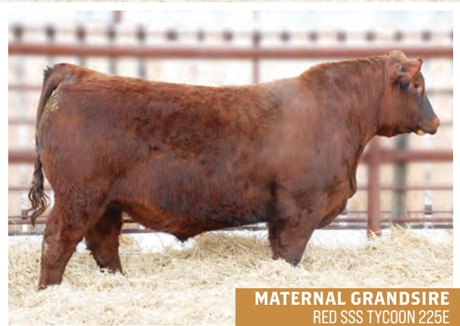
MATERNAL GRANDSIRE RED SSS TYCOON 225E

62N is one of the absolute favorites and sale features of the Lit Up sire group. His dam 48J is a stunning cow with an absolute beautiful utter. His granddam 3Z was also a gorgeous Brown Creek Cow with a perfect utter and a great production record. 48J was one of our top picks to AI to Lit Up to bring in some fresh new genetics with exceptional cows in the pedigree. 62N is a very impressive individual that is masculine, deep ribbed, very good footed and attractive herd bull. This bull has a lot to offer both phenotypically and genetically