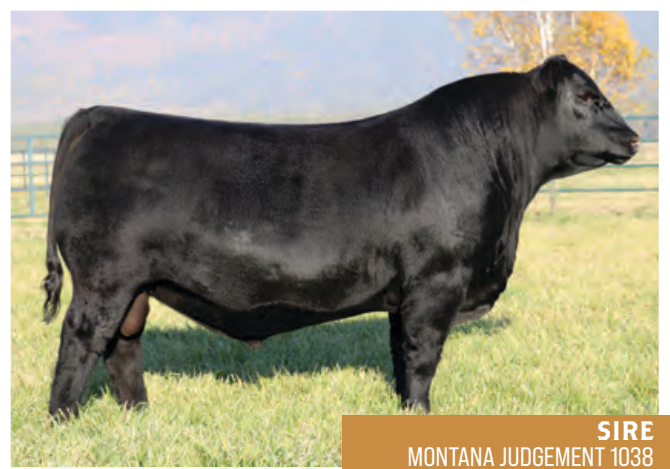
SIRE MONTANA JUDGEMENT 1038

Definitely a sale feature this year, a favorite choice of many. 6N has stood out since an early age alongside his beautiful uttered dam who has been absolutely outstanding here. These Montana Judgement sons possess a lot of the characteristics we are trying to achieve at W Sunrise. They are up headed, nice skulled, attractive, hairy, big middled bulls with a flawless phenotype. 6N is backed by some of the nicest cows on both side of the border. The Montana Judgement sire group this year is defiantly one we are excited about for many reasons. The exemplify as much performance, mass and masculinity while still maintaining a highly maternal line. They are sound made, free moving, real world cattle.