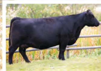
MATERNAL GRANDDAM BROOKING QUEEN 5067