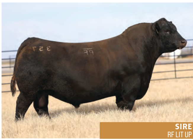
SIRE RF LIT UP

Staying true to the maternal side with his highly attractive look, RF Lit Up was a must have for us. One of the most, if not the most, impressive herd bulls I have ever seen. Once the dust settled, he had sold to Duff Cattle for $190,000 and we were lucky enough to buy the Canadian rights on this impressive herd bull. We are extremely excited to bring this new and exciting sire group. Lot 1 is exactly what we were hoping for from Lit Up, he is perfect in his structure and phenotype and stands on great feet. He is highly attractive with a "look at me" herd bull presence. Not to mention, comes from one of the nicest cows on the ranch. Brooking Annie K is a highly attractive, big middled cow with exceptional foot and utter and a highly productive track record