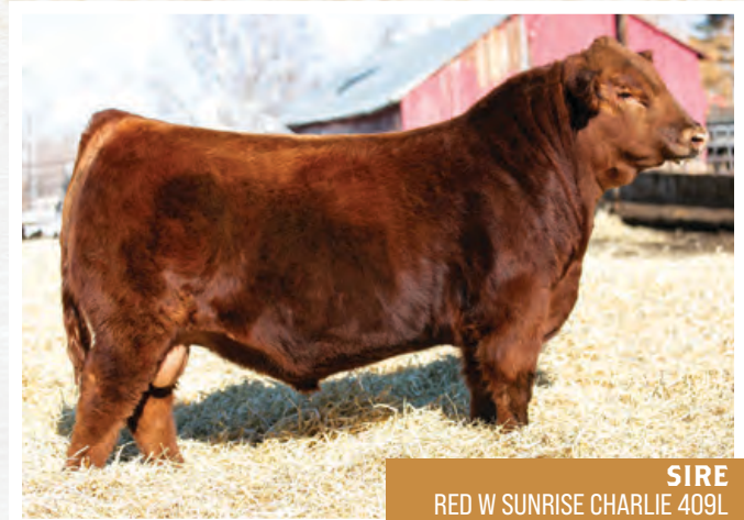
SIRE RED W SUNRISE CHARLIE 409L

Here is the first sons to sell off of Red W Sunrise Charlie 409L. 409L was a very special herd bull that was raised by the great Moose Creek Brndina 26E donor cow. 409L went to our good friends at Shaggy Meadows Red Angus, where he has done a tremendous job. He was admired for his big-time herd bull presence and his unbelievable look about him. 98N possesses a lot of the same characteristics as his great sire. He is up headed, sharp fronted and had a herd bull look at a very young age.