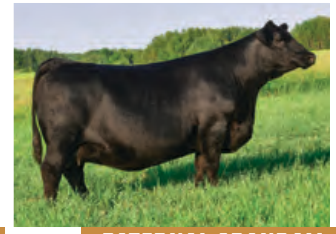
PATERNAL GRANDAM LFE BA JENNIFER 29J