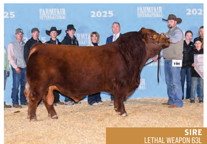
SIRE LETHAL WEAPON 63L

Without a debt a sale feature in this year's bull sale. My favorite red Simmental bull and for good reasons. He is stout, great footed, nice headed and has an unmistakable herd bull presence. Here is a bull with a big-time pedigree backing him. Lethal Weapon was Grand Champion at Farm Fair and at Olds Fall Classic. Not to mention his world renown donor dam is absolutely stunning and has an unbelievable production record. Here is a big time bull that can do a lot for any program.