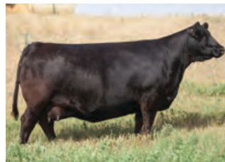
PATERNAL GRANDAM BROOKING BEAUTY 333