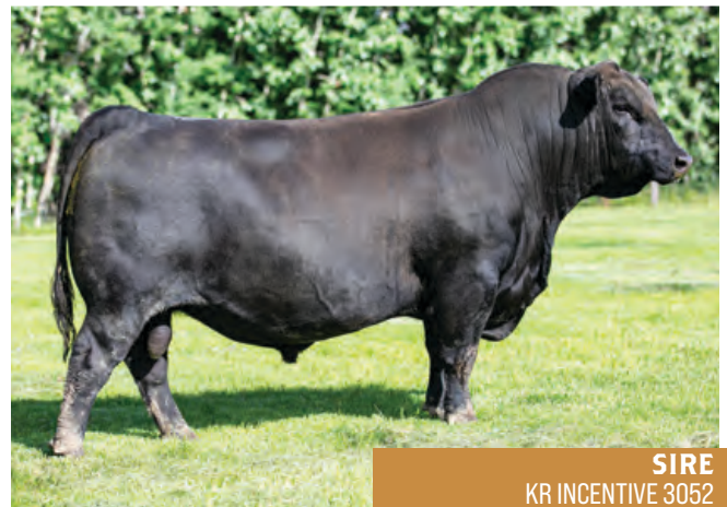
SIRE KR INCENTIVE 3052

Here is an exciting new outcross calving ease sire group. We have been excited about these calves ever since the first one was born. The KR Incentive calves come easy and grow like crazy. They have as much performance, shape and style as any heifer bull we have ever used. They are sound made and highly maternal, and offer a different twist in pedigree to any program in Canada. We were lucky enough to obtain a semen pack from our good friends at Golden Oaks and we couldn't be more pleased with the first calf crop. Not to mention the best part about this new outcross sire is not only can he make outstanding bulls but the females are looking to be exceptional. 33N is an Incentive calf that is royally bred here. Backed by the cherished Annie K cow family, this young herd bull offers a unique maternal package. He has an exciting herd bull presence with true angus characteristics. His maternal granddam Brooking Annie K 5106 has been an exceptional donor dam with a highly predictable performance record.