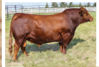
SIRE SVS RANCHER 42H