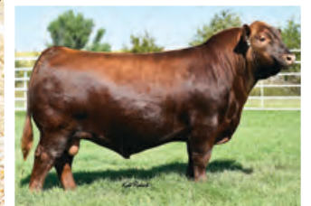
PATERNAL GRANDSIRE RED PIE CAPTAIN 057