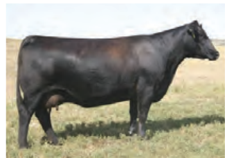
DAM S A V EMBLYNETTE 3325