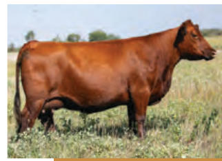
PATERNAL GRANDAM RED BROWN CREEK SOAPY 137C