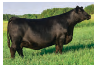
PATERNAL GRANDAM LFE BA JENNIFER 29J