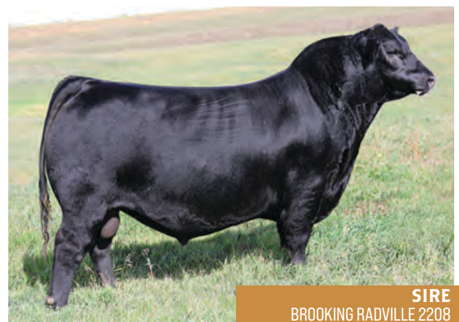
SIRE BROOKING RADVILLE 2208

A big-time calving ease herd bull, that has an absolutely stacked maternal pedigree. 325N is an exciting herd bull that can't be missed in the pen, he has an amazing "come look at me" presence and a flawless phenotype. He exemplifies true angus characteristics while carrying a big-time herd bull look. The females in this extraordinary bulls pedigree are unmatched in the industry for looks and production. His sire Brooking Radville has sired some of the top selling females in Canada. Not only can he sire big time bulls he can make an exceptional female. These qualities are hard to find in a herd bull.