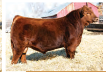
MATERNAL BROTHER TMP 409L