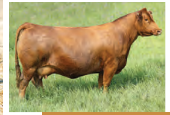
PATERNAL GRANDAM HLTS SAMMIE