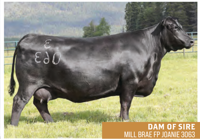
DAM OF SIRE MILL BRAE FP JOANIE 3063