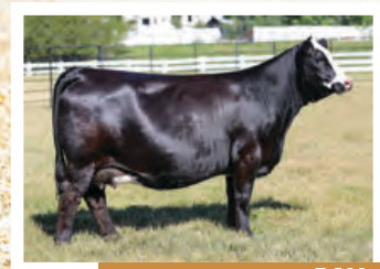
DAM LFE BS MARY 640K