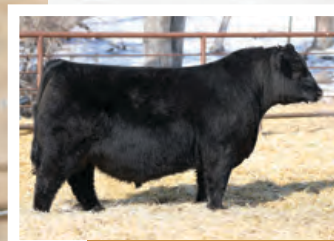
MATERNAL BROTHER TMP 4J