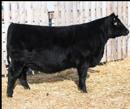
SOLD TO UNGER LAND AND LIVESTOCK FOR $11,750