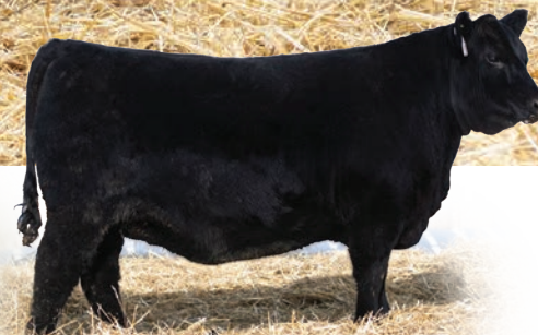
MAT. SISTER - GRACO ABIGAIL 4367

Graco Abigale 5450 is a stout made standout SAV Scale House daughter that catches everyone's attention the second they walk into the heifer pen! Her maternal sister sold for $9,000 to Lightfoot Holdings last year. We felt the need to show the female making side of our Scale House breeding and this heifer sure represents what we are trying to achieve.