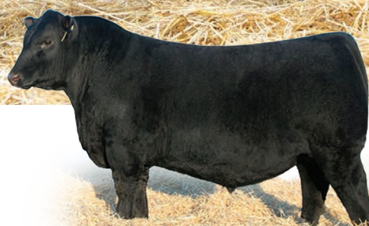
S A V BLOODLINE 9578