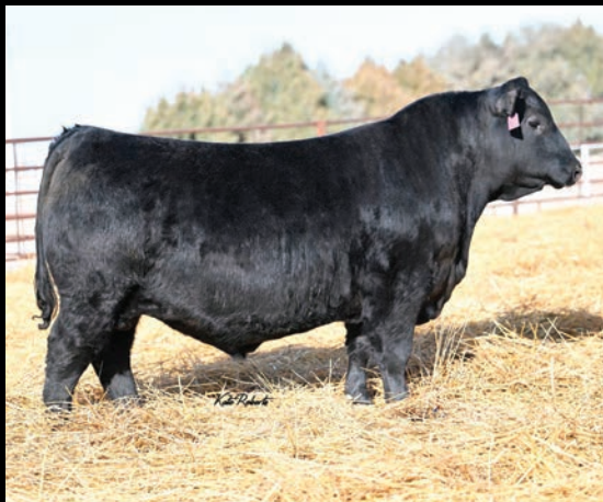
SERVICE SIRE - ELLINGSON LAKOTA

With the market demand for top quality purebred replacement heifers, we felt the need to ensure our customers are getting that extra value with their purchase of a Graco heifer. All sale heifers have been halter broke and can remain at the ranch with the option for us to synchronize the heifers to fit your spring calving season and AI them to the $150,000 high selling heifer bull Ellingson Lakota at no additional cost.