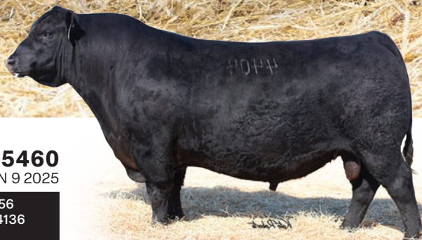
BASIN RAINMAKER 4404

BW: 82 lbs. Act. WW 772 lbs. Parent Verified