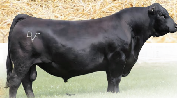
DEER VALLEY GROWTH FUND

When Kate purchased 1N's dam in our first annual sale, we talked about this mating and how it would result in a ton of performance! Well the results are in and 1N is a big league Growth Fund daughter with loads of shape, capacity and performance she has a beautiful Angus head and profiles perfectly.