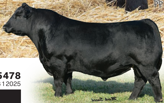
PVF INSIGHT 0129

BW: 76 lbs. Act. WW 780 lbs. Parent Verified