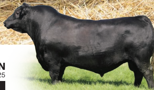
COLEMAN BRAVO 6313

BW: 84 lbs. Act. WW 676 lbs. Parent Verified