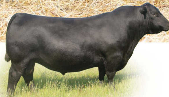
S A V RAINFALL 6846

A Sitz Resilient daughter out of an SAV Rainfall cow, Graco Queen 5472 has that feminine Angus look with some calving ease built in on the maternal side. With limited semen on the market, there won't be many opportunities to acquire a daughter of this caliber.