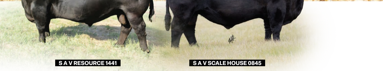
S A V RESOURCE 1441

BW: 87 lbs. Act. WW 754 lbs. Parent Verified