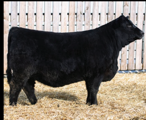
SOLD TO UNGER LAND AND LIVESTOCK FOR $10,250