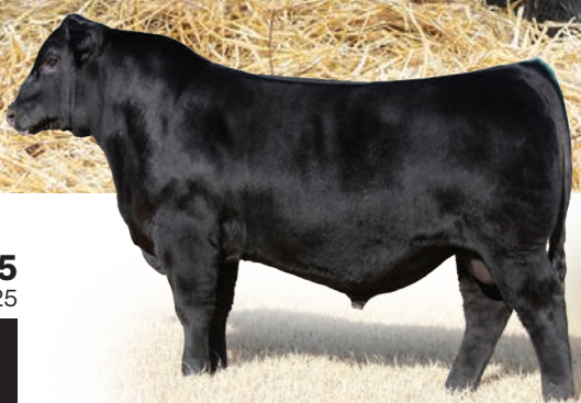
WILKS REGIMENT 9035

BW: 74 lbs. Act. WW 868 lbs. Parent Verified