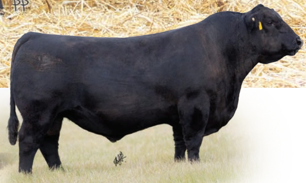
S A V SCALE HOUSE 0845

Another SAV Scale House son that is sure to add pounds to your calf crop! Graco Scale House 5445 is a bull with added frame size, length of spine and great docility. His maternal sister sold in last year's sale to Unger Land and Livestock for $10,250.