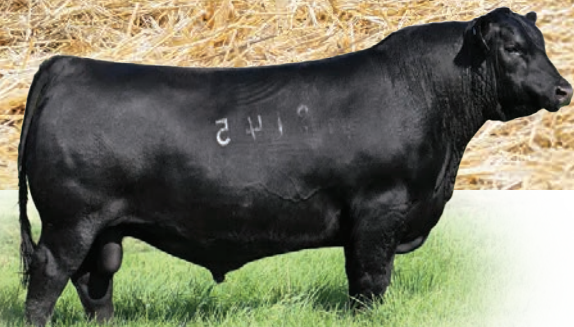
COLEMAN TRIUMPH 9145

Here's a heifer that holds her head elegantly and shows off her nice front end and level chest floor. Her maternal sister is working at Country View Angus in Miami, Manitoba, and just sold a son for $9000. Her maternal brother sold to Muddy View Ranch and two maternal sisters have been retained in the herd and have both sold progeny through our sales.