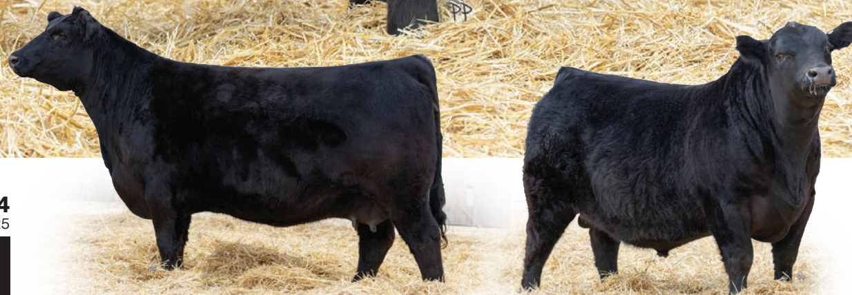
GRACO ERICA 3302

BW: 77 lbs. Act. WW 936 lbs. Parent Verified