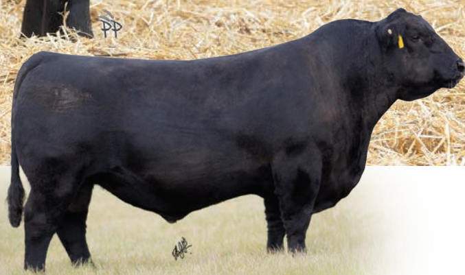
S A V SCALE HOUSE 0845

BW: 94 lbs. Act. WW 946 lbs. Parent Verified