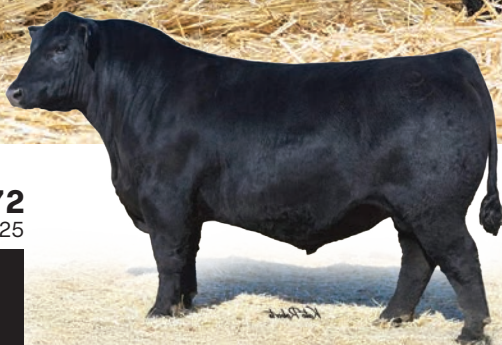
SITZ RESILIENT 10208

BW: 64 lbs. Act. WW 678 lbs. Parent Verified