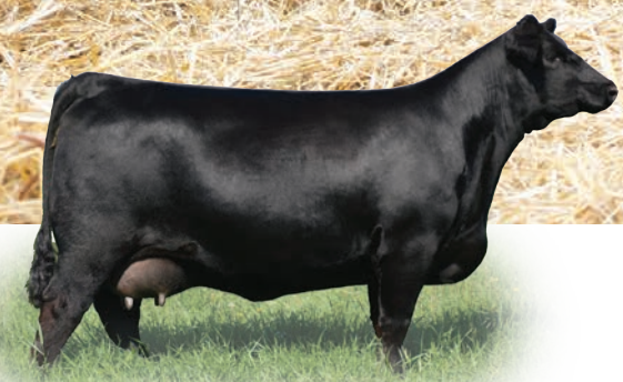
BAR-E-L ERICA 74A

A nice cow bull option with a wide top, tight sheath and big crest! A bull who exhibits all the traits from the maternal cow power stacked on both sides of his pedigree. Don't miss out on this Bar-E-L 74A grandson on sale day. CE *