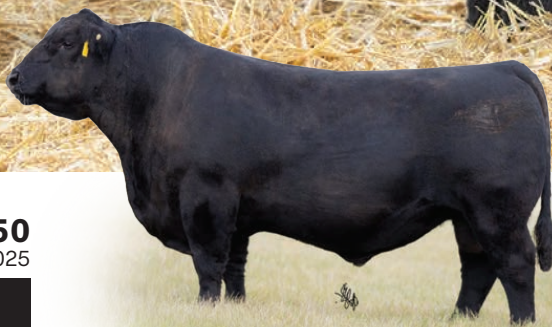
S A V SCALE HOUSE 0845

BW: 80 lbs. Act. WW 792 lbs. Parent Verified