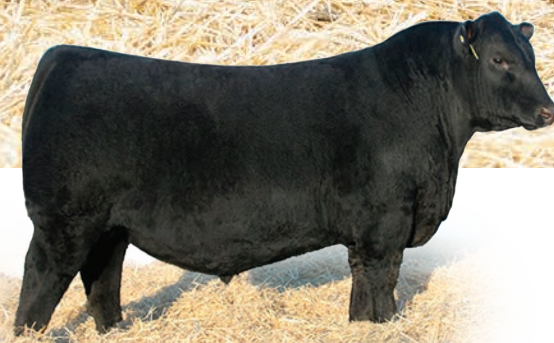
S A V BLOODLINE 9578

Look no further for a heifer with growth and frame to incorporate into your herd. This Bloodline daughter has that wrapped up into one package. With a maternal pedigree stacked on both sides, she's bred to be a great brood cow.