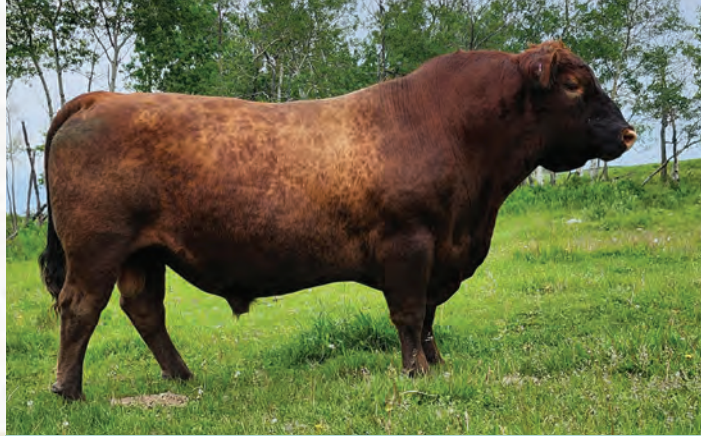
Red DKF Racer 39H aka GITCH

Red DKF Racer 39H, a.k.a GITCH, was purchased after attending a Saskatchewan Angus tour in the summer of 2019. We were so impressed that day with the display at DKF Angus, we knew our next Red Angus heifer bull was coming from there. This bull is as phenotypically correct as you can make them. A bonus was to see Final Answer in the pedigree, making his females the keeper kind! He is very easy to work with, which is a must here! He has calved heifers very successfully for the last 4 calving seasons, and the best part is they grow!!