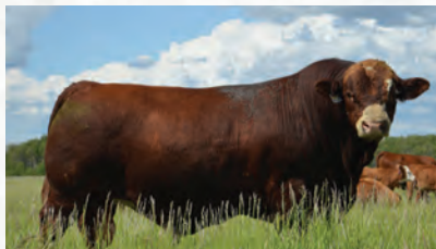
ZSL Tillman 127H

Krush was purchased from Double F Cattle Co for $16,000. Jayne found this true curve bender as we were looking for a great cross for the Gomez females. He boasts a 69 lb birthweight, a 914 lb adjusted weaning weight and a 1623 lb adjusted yearling weight. He ranks in the TOP 15% for Calving Ease, Top 20% Birthweight, Top 2% Weaning Weight and TOP 1% Yearling Weight in the breed!