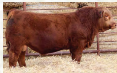
WF Walk the Line 140L

ZSL Tillman 127H was the high selling bull at the Spring Lake Bull Sale at $35,000. We were fortunate to purchase the shared walking rights on this gentle giant! Tillman has an exceptional foot and it carries on to his offspring! The length he adds to his calves is second to none! We have bred Tillman to purebred cows and commercial