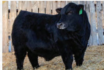
DFCC 126H Krush 67K

The search for a Simmental heifer bull led us to Korona! Darnell Fornwald checked him out for us and highly recommended this calving ease specialist. His birthweight was 74 lbs, with an adjusted weaning weight of 909 lbs which puts him in the TOP 2% calving ease and Top 3% birth weight of the Simmental breed! He calved heifers flawlessly along with some selected cows. The bull calves seem to have some grow and the heifer calves look great! Korona's sons were very well received at last year's sale!