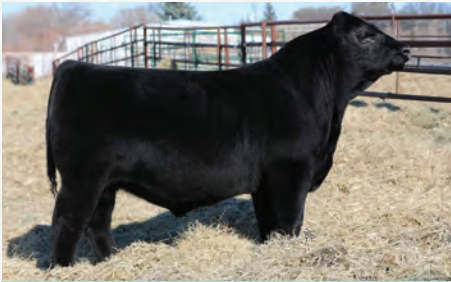
WKJ Dusty's Gomez 4G