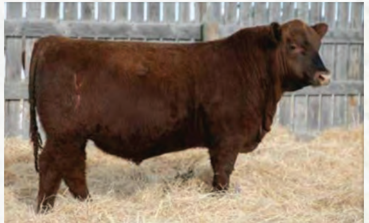
RED Blake's Moncrief 15M