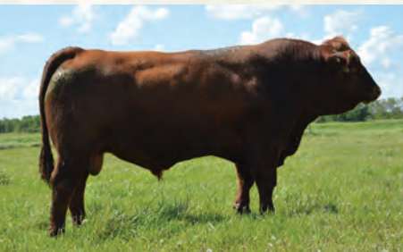
Circle G Korona 65K