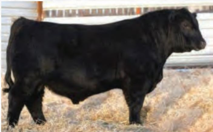
Standard Hill Blazer 34M - co-owned with Standard Hill Livestock