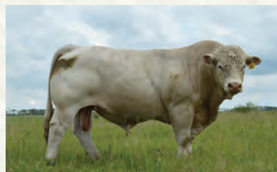
HVA Delco 262J

140L was purchased from Wallgrens' in Alberta solely for his maternal strength, having quite possibly the best two Red Simmental females in the breed in his pedigree. His dam is none other than WFL Red Sage 506C. She is currently the #1 female in the Simmental breed with the most progeny. His Paternal grandmother is IRCC Darlin 613D. Her progeny has taken the