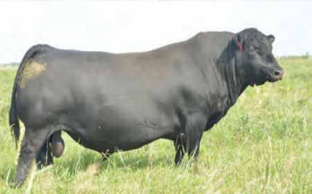
WKJ Jeter 4J