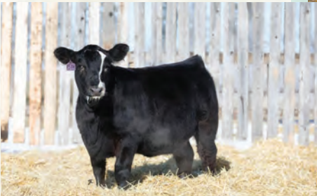
RUT 151H - Maternal sister

RUT Matt 98M is a \frac{3}{4} blood Korona son! He should calve easy, as he ranks in the top 10% for calving and birth weight. His mother is a Red Baron daughter that gets it done! A maternal sister was a feature heifer calf a few years back in the Shades sale.