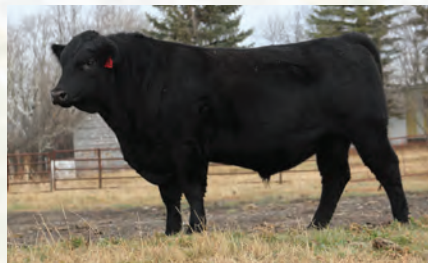
WKJ League 80L | Service Sire

Heifers exposed to WKJ League 80L (Jeter son) from June 10th to Sept 1st Additional exposure to a Motive son from GT Angus