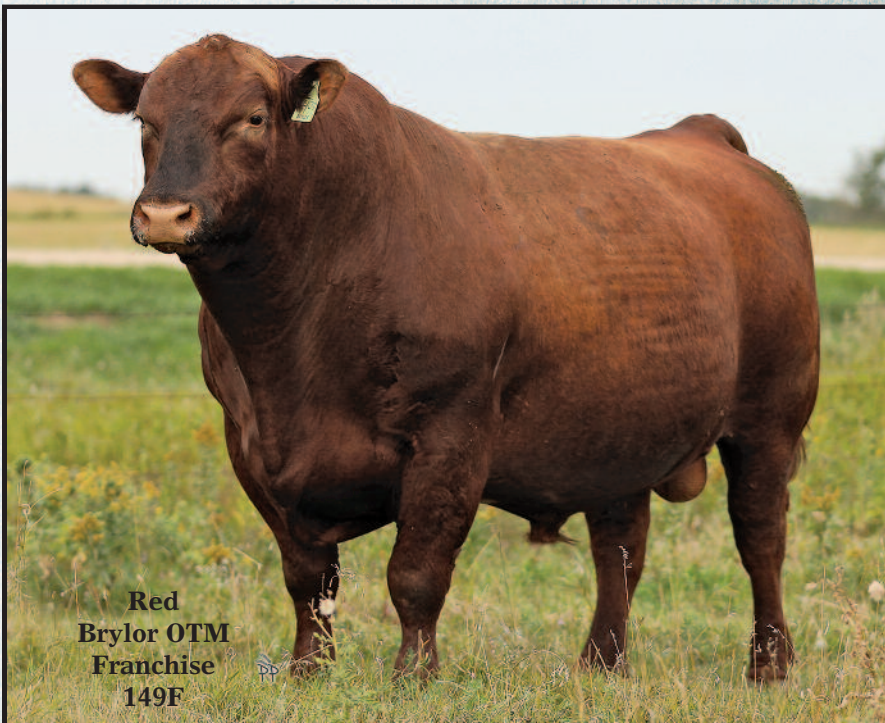
Red Brylor OTM Franchise 149F

A real sale feature here! The only off-age bull we have and he's a stand alone - stand out kind of a Herd Sire prospect. He's a September born very low birth weight heifer bull candidate for sure. His sire was our $27,000 high seller to WRAZ & Red Ember in 2020. He was featured on the WRAZ Dispersal catalogue last fall. His first daughters now in production are gorgeous. 4K's dam is a big strong Assassin daughter with tons of volume, great feet and beautiful udder. She was an $11,500 feature at WRAZ Dispersal and is now owned by the International Fabulous Females group and leads their Donor division.