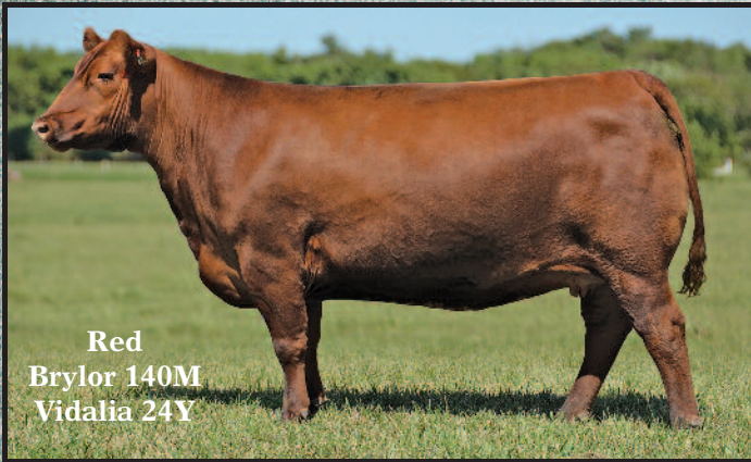
Red Brylor 140M Vidalia 24Y