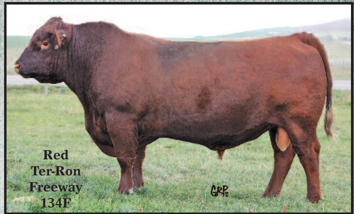
Red Ter-Ron Freeway 134F