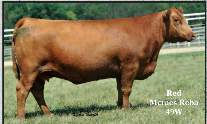
Red Mcraes Reba 49W

Maybe the most massive Sale bull we have. An ET son of Maria 53A & the 49D son who topped our Bull sale in 2020 at $27,000. He has a brother selling as Lot 18 today by the 53A cow.