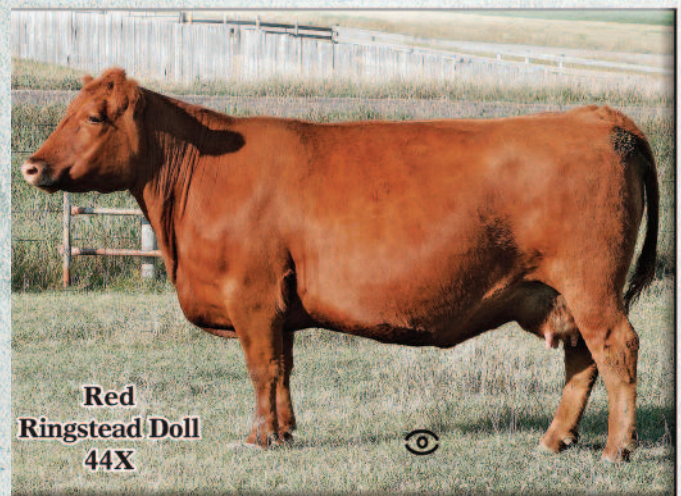
Red Ringstead Doll 44X