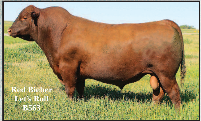
Red Bieber Let's Roll B563