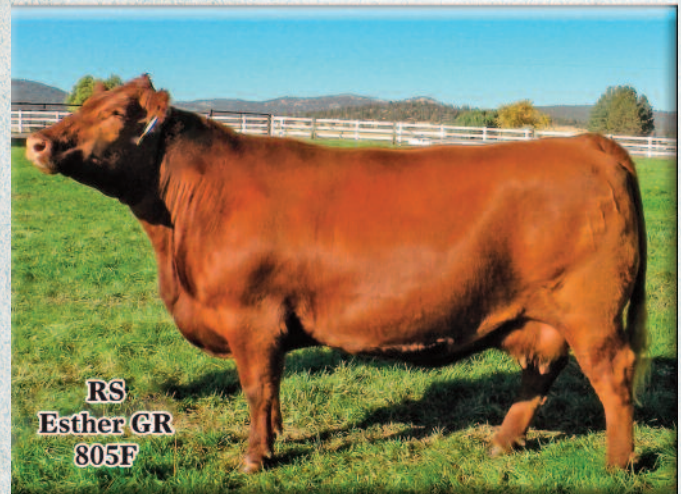
RS Esther GR 805F