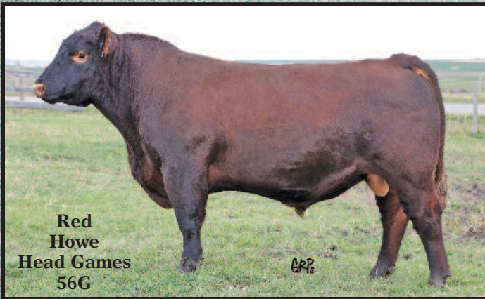
Red Howe Head Games 56G