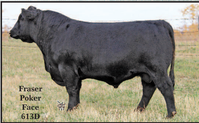
Fraser Poker Face 613D