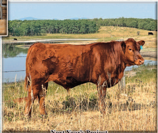
Next Year's Project

All Three Steers are Home-Raised True Half-Bloods.