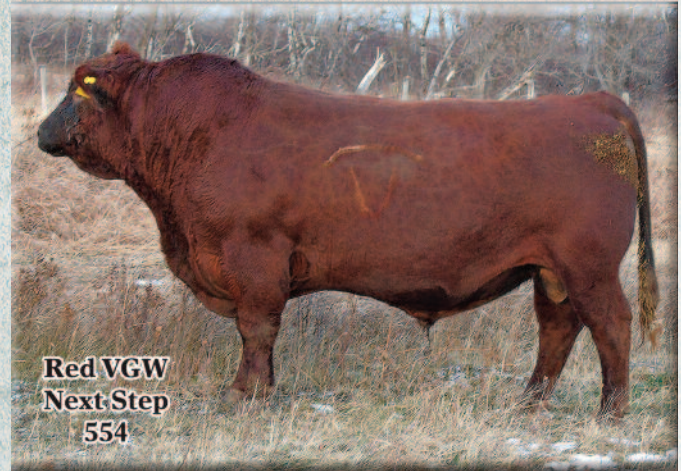
Red VGW Next Step 554