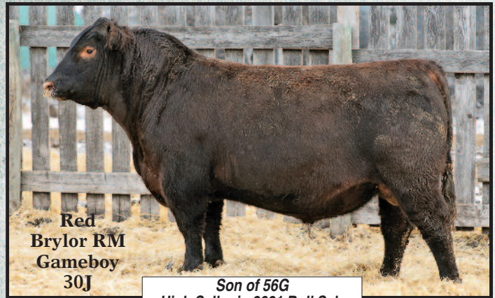
Red Brylor RM Gameboy 30J

Son of 56G High Seller in 2021 Bull Sale $30,000 to WRAZ Red Angus