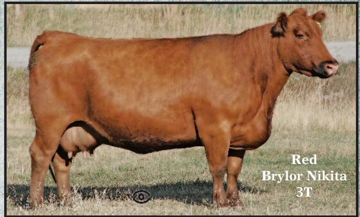
Red Brylor Nikita 3T