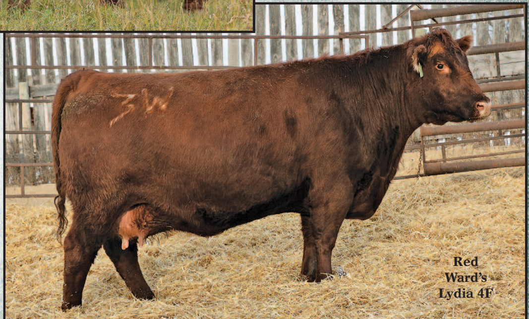
Red Ward's Lydia 4F