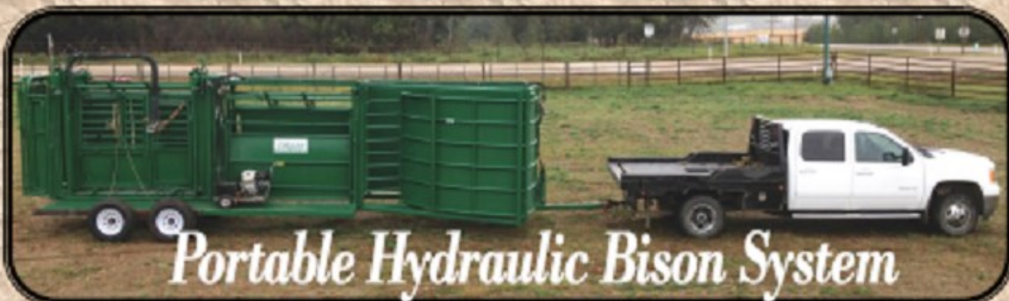
Portable Hydraulic Bison System

Quality Livestock Handling Equipment Built with Your Safety in Mind!