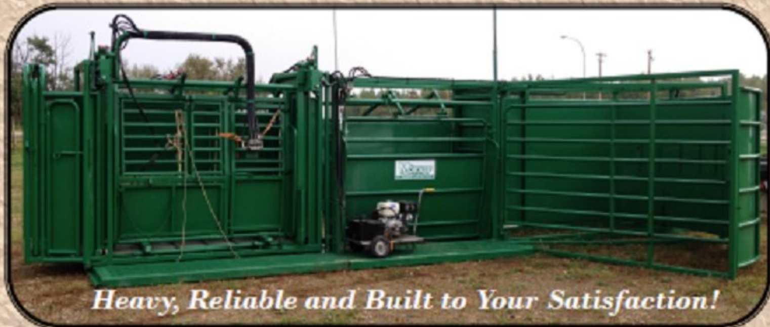
Heavy, Reliable and Built to Your Satisfaction!