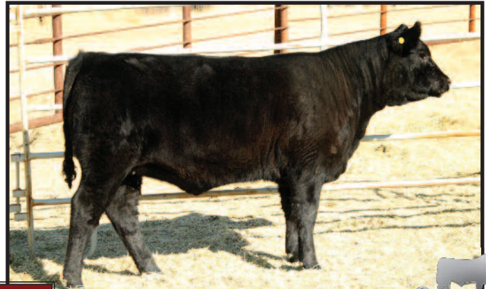
Lot 29A Southland Dana 35Z