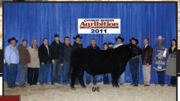
Lot 1C Southland Thriller 83X - CWA Champion