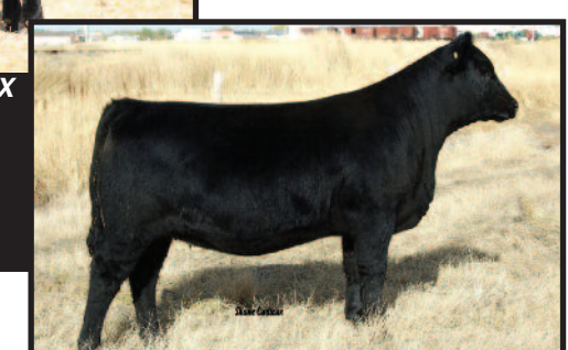
Southland Hot Stuff 65T Maternal Sister to Lot 52 & 52A Purchased by Noreseman Farms