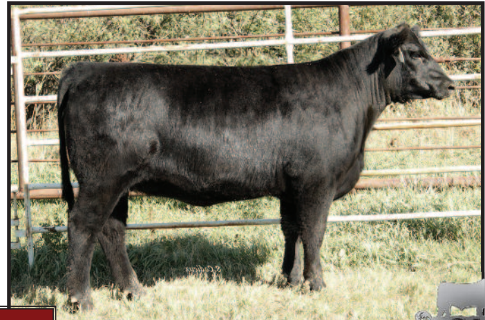
Southland Dana 134X - Daughter of Lot 29 Purchased by Symens Land & Cattle