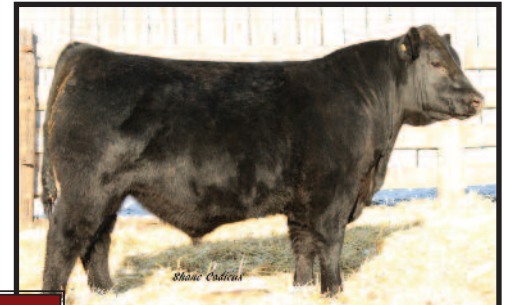
Southland Style 16Y Son of Lot 13 Purchased by T – T Ranch, Bill Armstrong