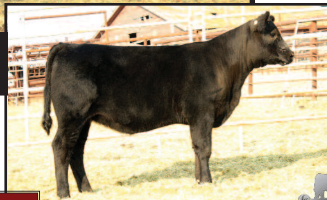
Lot 2A Southland Madison 126Z