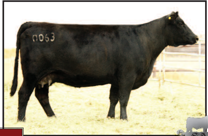
Lot 41 Southland Barbara 63X