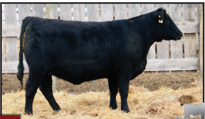
Lot 18B Southland Fate 302X