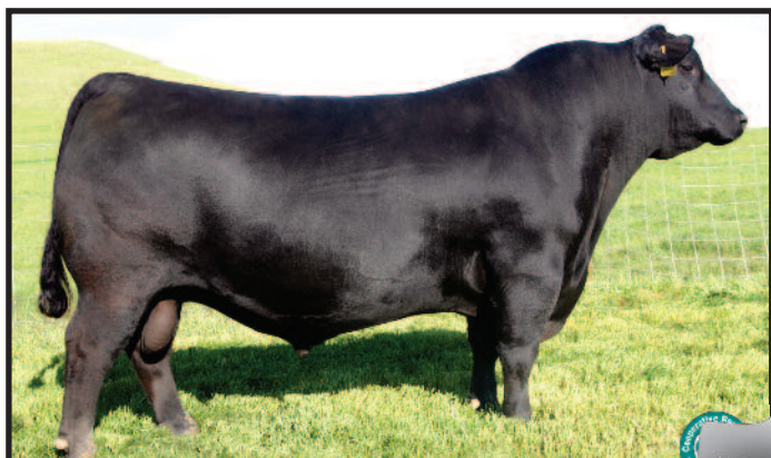
Sire of Lot 38 SAV Pioneer