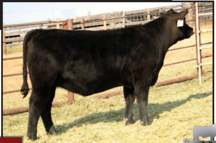
Lot 23A SOUTHLAND ROSEBUD 9Z