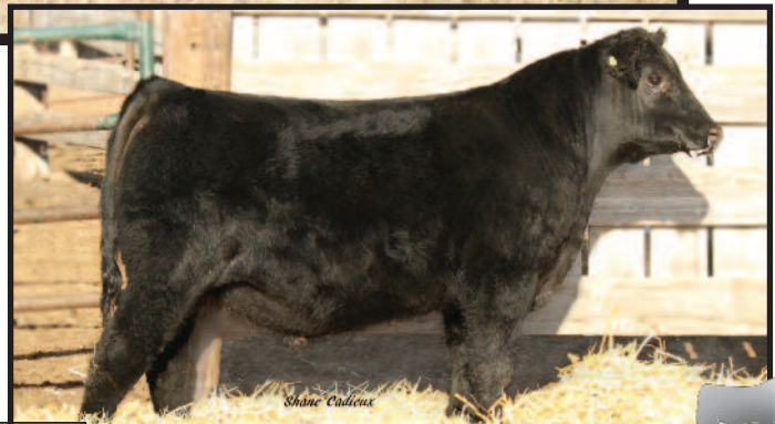
Southland Sense 101Y – Son of Lot 1 Purchased by Joseph Halyung