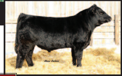
Southland Main Street 52W Son of Lot 3