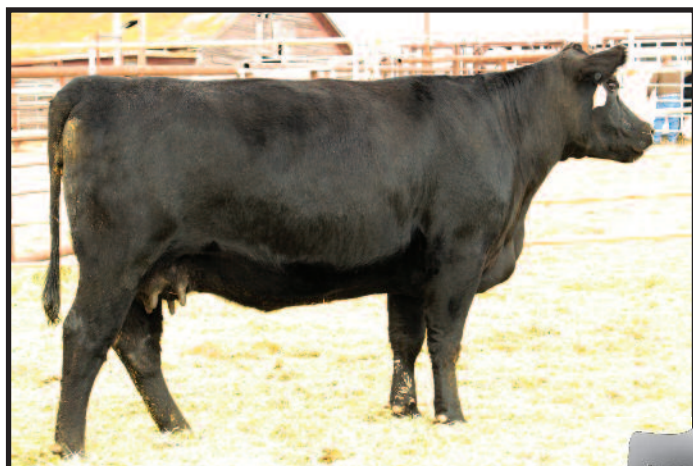
Lot 40 Southland Dixie 46X