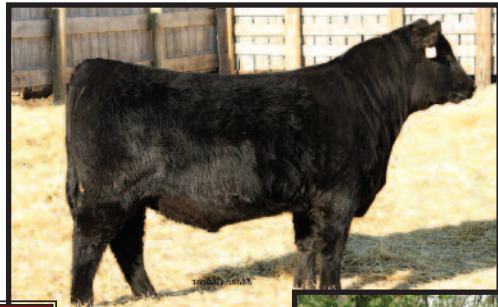
Southland Style 27Y Son of Lot 11 Purchased by Buchko Angus