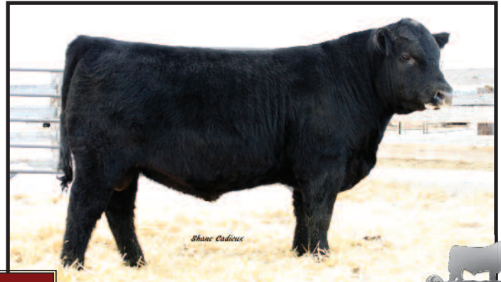
Southland Route 66 66X Son of Lot 9 - purchased by Lyle Stork