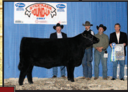
Lot 19 Show Picture Lloydminster Champion