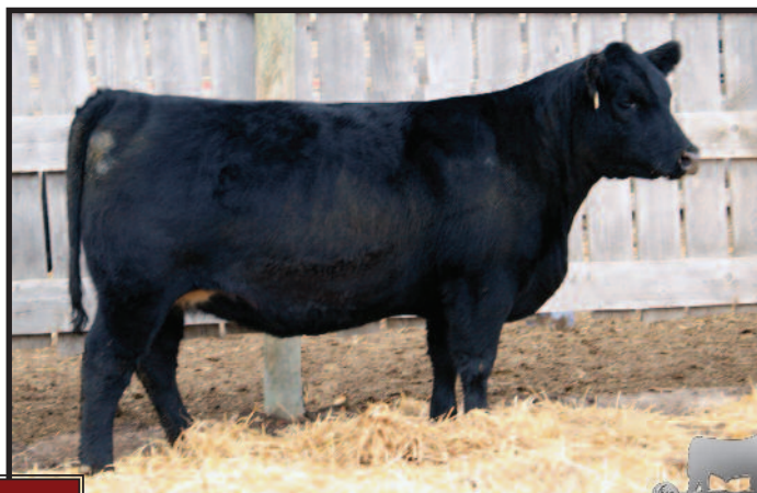
Lot 35B Southland Rosebud 2Y

AI bred to BPF Special Focus 504 May 21 Exposed to BCAR Preference 122Y June 5 - July 30. Favorable to the AI