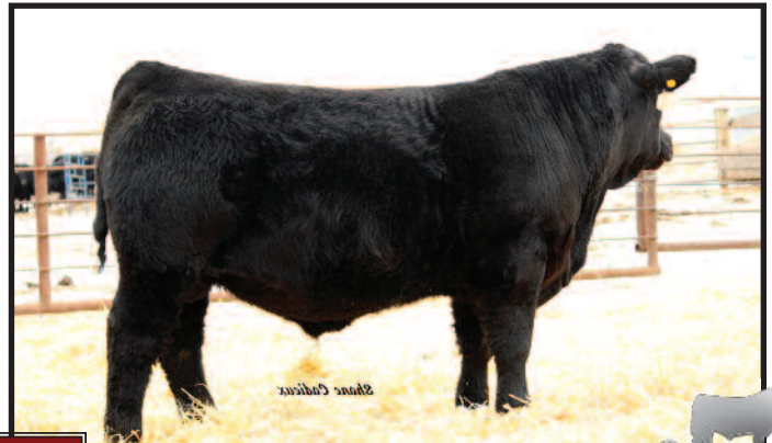
Southland Fringe 29Y Son of Lot 21 - Purchased by PFRA