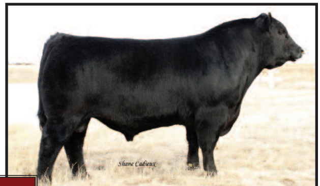
Southland Two Fitty 250T Owned with Currie Angus