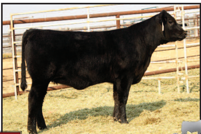
Lot 19A Southland Twist of Fate 32Z