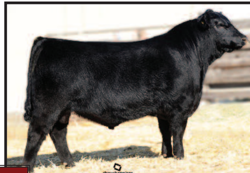
Southland Brooklyn 64X Son of Lot 13 Purchased by Nightshade Angus