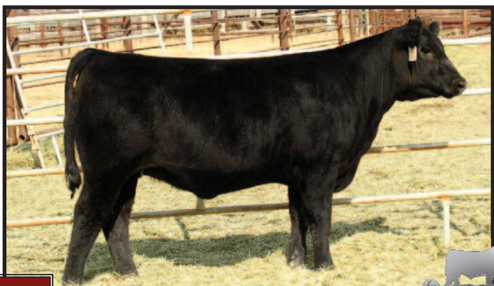
Lot 11A Southland Dana 4Z