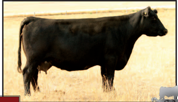
Southland Hottie 136T Dam of Lot 46 - Southland Hottie 107X