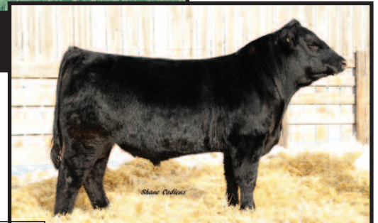
Southland Main Street 52W Owned with LLB Angus Full brother to Lot 47