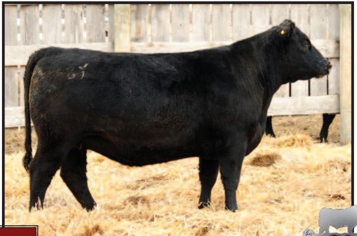
Lot 23B SOUTHLAND ROSEBUD 68Y