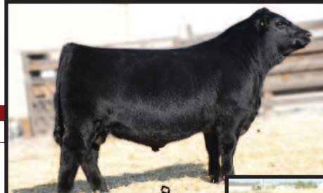
Lot 51 Southland Erica 64Y