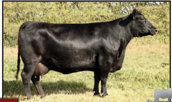
SOUTHLAND ON TIME 21M DAM OF LOT 8