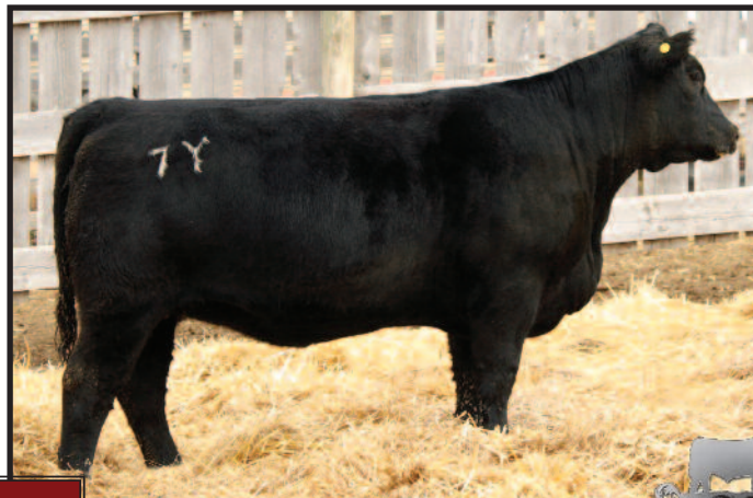
Lot 2B Southland Madison 7Y