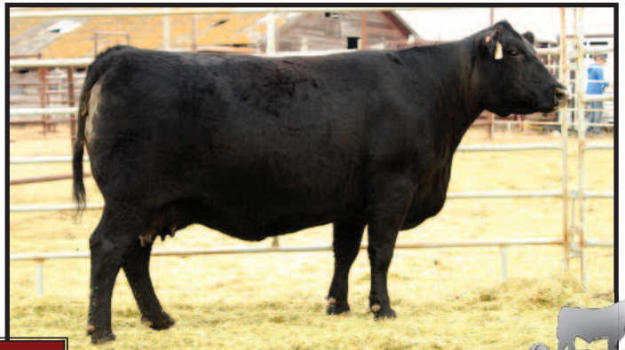
Southland Erica 94P Lot 10