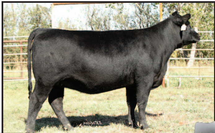
Southland Lena 119X - Daughter of Lot 25 Purchased by Silver Sage Angus