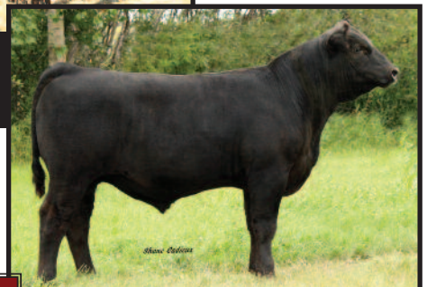
Southland Tommy Lee 133X Son of Lot 11 - Purchased by Hird Angus