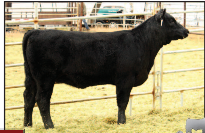
Lot 15A Southland Blackbird 18Z