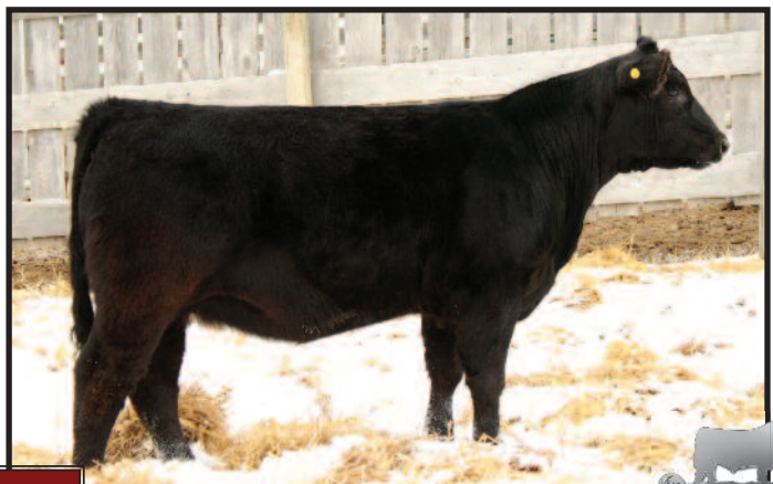
LOT 1A SOUTHLAND BELLE 60Z