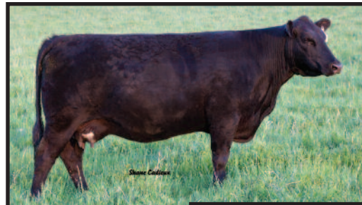
Southland Lady 201M Dam of Lot 47