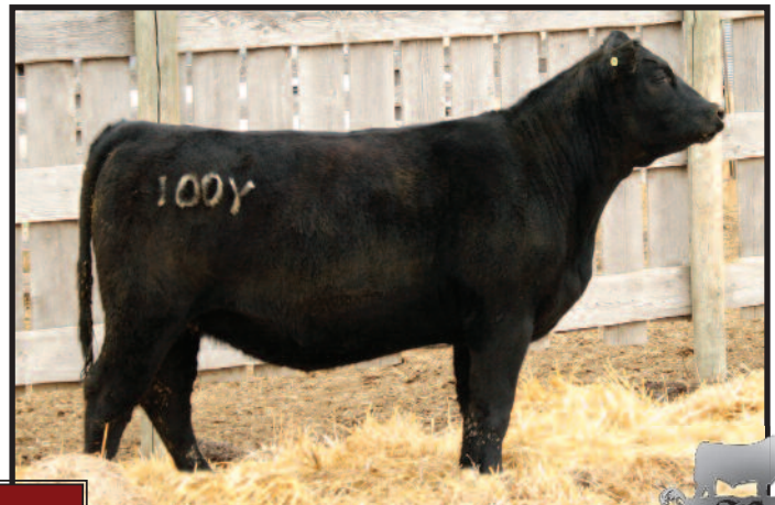
Lot 20B Southland Duchess 100Y