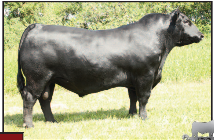
Werner Street Sense 247 Sire of Lot 20B