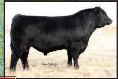
Southland Two Fitty 250T Son of Lot 3