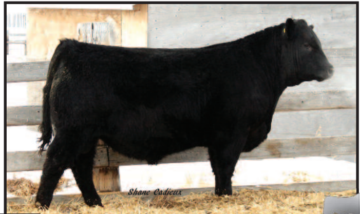
Southland Free Ride 207X - Son of Lot 15 Purchased by Glendale Ranch Ltd.