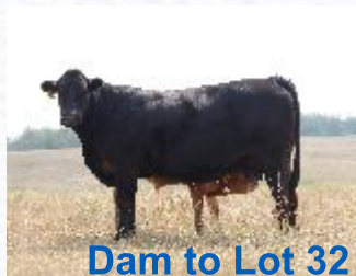
Dam to Lot 32