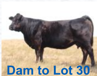
Dam to Lot 30