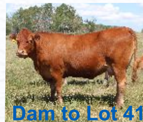
Dam to Lot 41