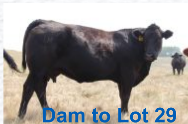
Dam to Lot 29