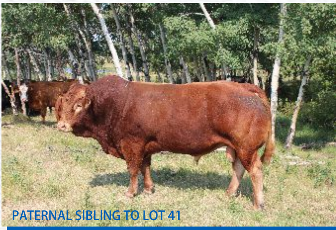
PATERNAL SIBLING TO LOT 41

We purchased YOUR PICK from Hillview Farms and we used him on cows. He was heavy muscled, moderate framed and his progeny are very similar. We have many females working for us now and they have nice udders with adequate milk. REFERENCE SIRE OF LOT 41